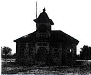
Fairfield School House, 1898