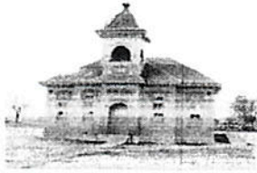
Fairfield School House, 1898