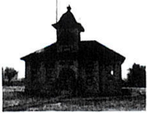
Fairfield School House, 1898